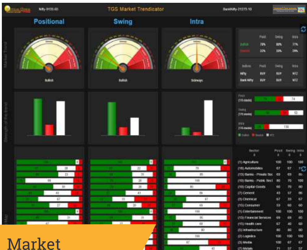
*For illustration purpose only